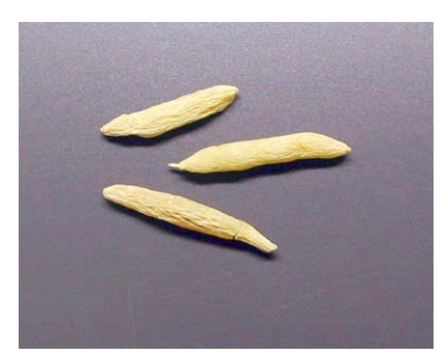
Chinese medicine: BAKUMONDOU:

Beneficial Effects of BAKUMONDOU (as a Chinese medicine) Anti-inflammatory, antiallergic, antihypertension, antitumor, antitussive